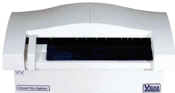
VIDAR's Dental Film Digitizer

The market for this device is specialists with film referrals and dentists who are hoping to delay some of their digital radiographic purchases, but still want to have a digital office.